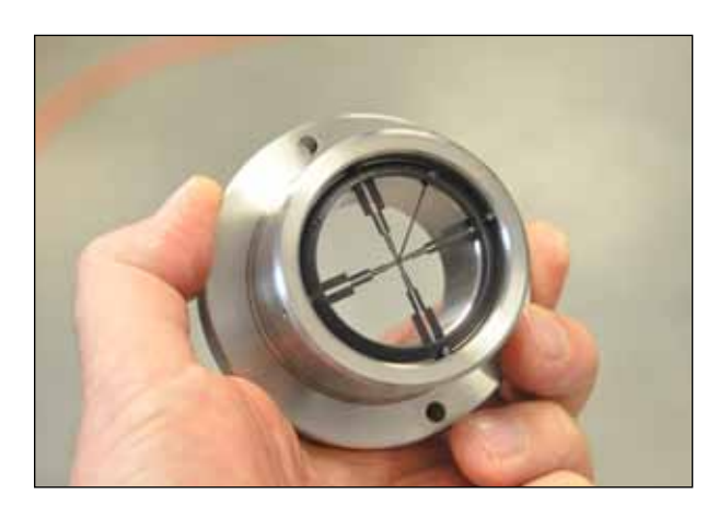
When viewing through the Brunson alignment telescope, the far side target will be distinguished from the near side with the use of a custom designed open wire target. The unique 45° "clocking wire" is easily visible up to distances of 50 feet.